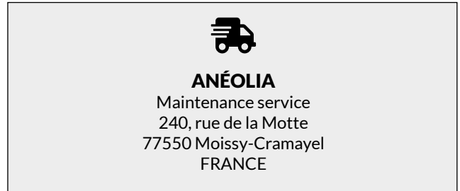
To After-sales service Anéolia