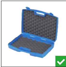
Its transport case

Document to be completed and enclosed with the package to facilitate the handling of your equipment upon receipt in our workshop. Please return your instrument with: