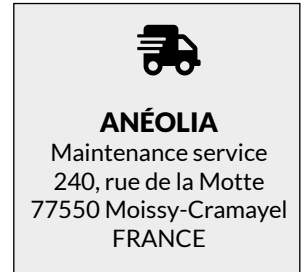
ANÉOLIA Maintenance service 240, rue de la Motte 77550 Moissy-Cramayel FRANCE To After-sales service Anéolia