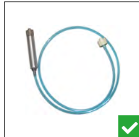
Its sampling kit Oxylos not concerned.