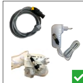
Its charger / external power supply