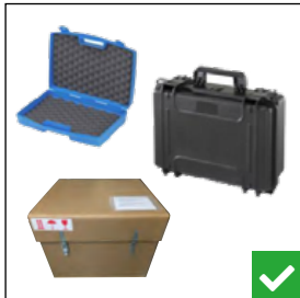
Its carry case or Oxylos wrap

Document to be completed and enclosed with the package to facilitate the handling of your equipment upon receipt in our workshop. Please return your instrument with: